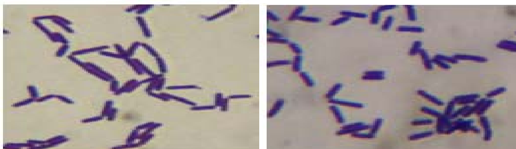
Fig. 2- Appearance Bacterial isolates as Gram Positive under light microscope.

(+ = Positive, - = Negative, A=Acid, d=Doubtful)