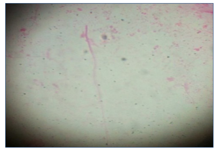
Fig. 1b- No head sperm