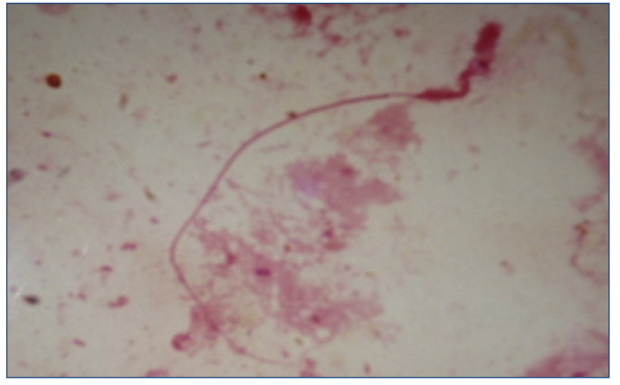
Fig. 1d- Thread sperm