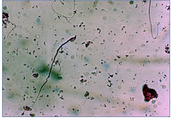
Fig. 1a- Normal sperm

Table 2- The Mean ± SD of sperm head abnormalities