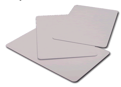
Fig. 1- Example of RFID card transponder used in our project. Operating frequency at 134,2 Khz; ISO/IEC11784/11785 compliant

The reason why only in recent years RFID has spread, is because its use has changed over times