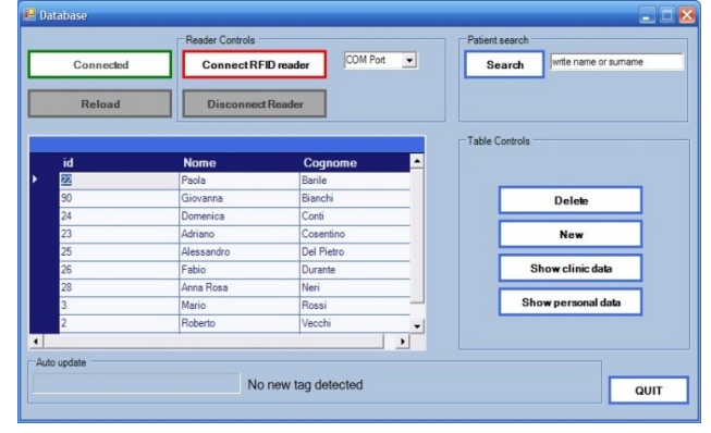
Fig. 3- Main menu

In the main window (Fig. 3.) are condensed all necessary controls to access software features as the data table and controls for managing records and information related to them. These controls reproduce features like search, delete, edit, create new record, regardless of the particular format of the database connected to the system (Access, SQLServer, MySQL). Indeed, designing the database control class through ADO.NET methods and the SQL language, allows a certain independence from the data source, which, in this context, translates into a great ease of integration with existing databases [3].