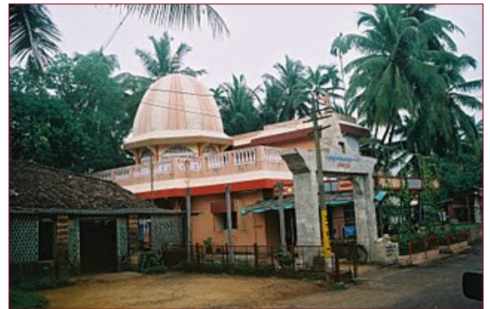
Fig. 7- Rawool Maharaj Math

This math is 3.5 km away from Kudal town. Rawoolmaharaj was a potent saint of Kankon who sacrificed himself for the welfare of the society. Later he self immolated himself at Pinguli, where math stands in him name [Fig-7].