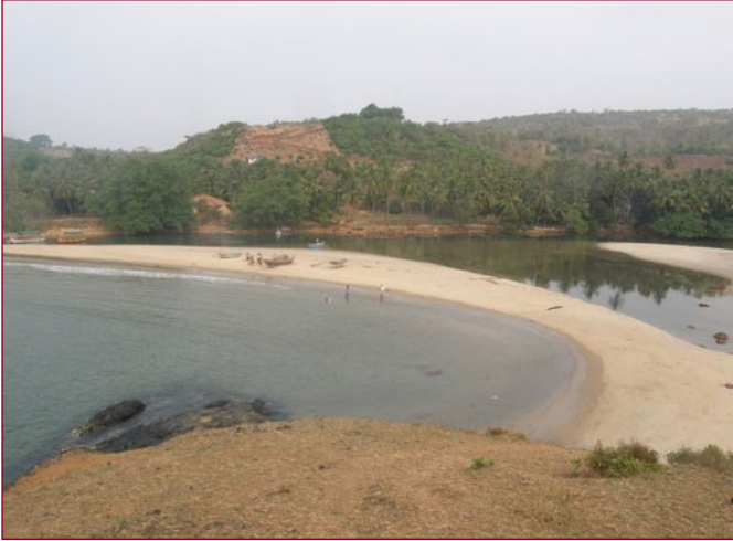
Fig. 9- Nivati Beach