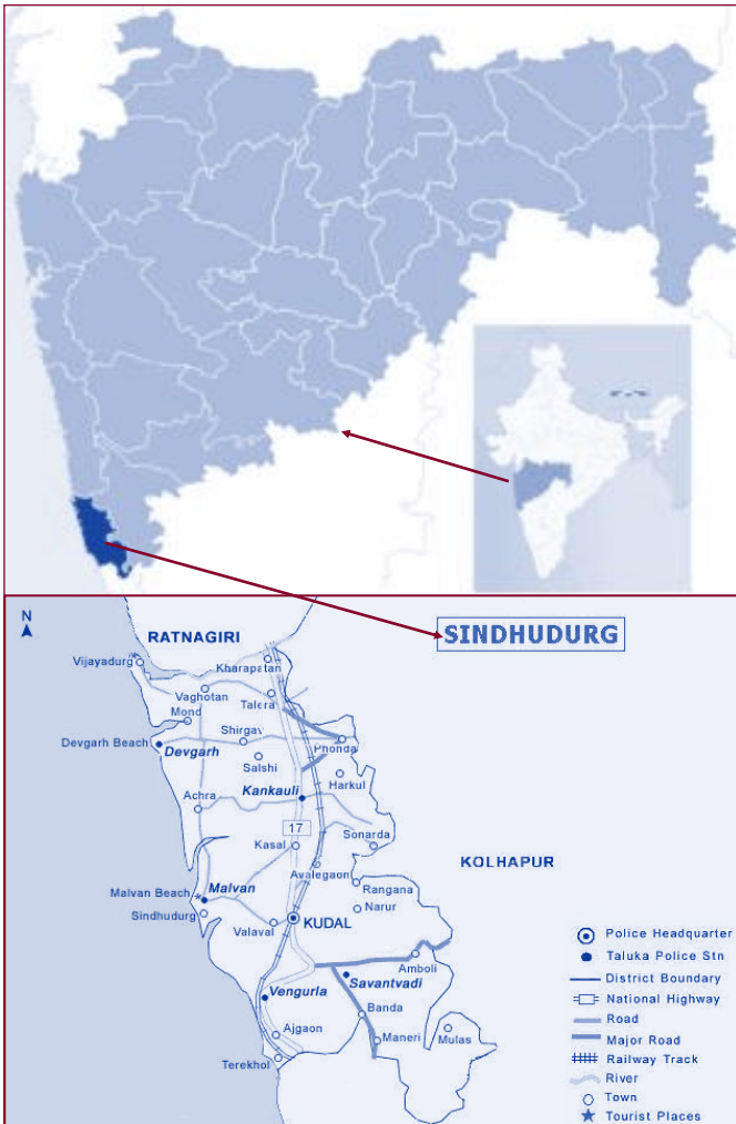
Fig. 1- Map of Sindhudurg district (Study area)

Sindhudurg mountain ranges [Fig-1]. Sindhudurg district is made up of green forest, heart catching varied fruit and flowers. This is the region of coconut, Jackfruit and all of world famous Alphonso Mango.