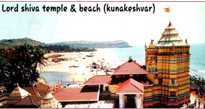
Fig. 4- Kunkeshwar Temple

Kunkeshwar in Devgataluka is an important Pilgrim Center in Konkan region and is famous for its fine and silver sand beach.