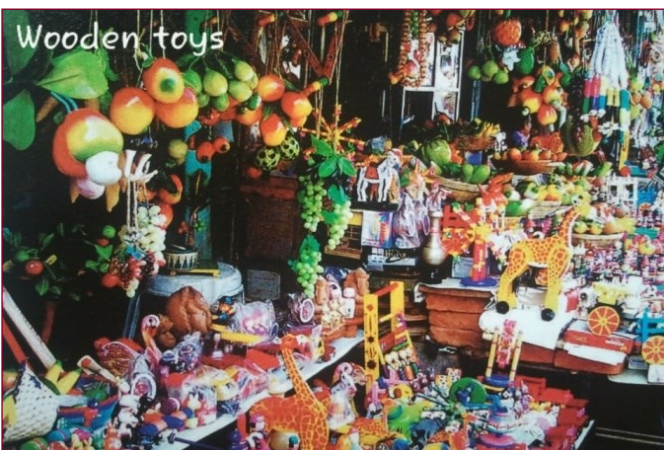
Fig. 11- Woodan toys of Sawantwadi

This town is well known for its wooden crafts, wooden toys, bamboo crafts, pottery art and tradition arts of painting [Fig-11].