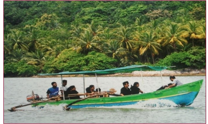
Fig. 12- Boating Sport at Dodamarg Taluka

At present Sindhudurg Soldier School and Colonels academy for adventure and aero-sports, sport camps, camps of tracking, rock-climbing, Rappelling, Navigation and Valley crossing.