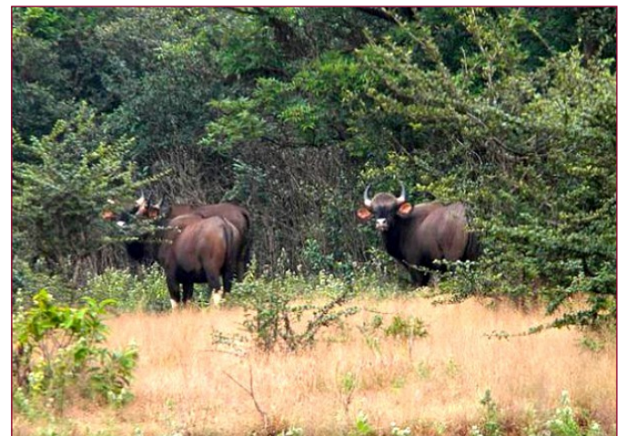
Fig. 3- Dajipur wild life sanctuary

Dajipur wild life sanctuary is an ideal place for film and adventure shooting. It is situated at the altitude of 1200 meters having cool, calm and pleasant climate throughout the year. Jungle is very thick and it is sprawling about 376 sq.kms. There are so many spectacular birds. The natural beauty, greenery, scenery and serene views around the huge ranges of the Sahyadri [Fig-3].