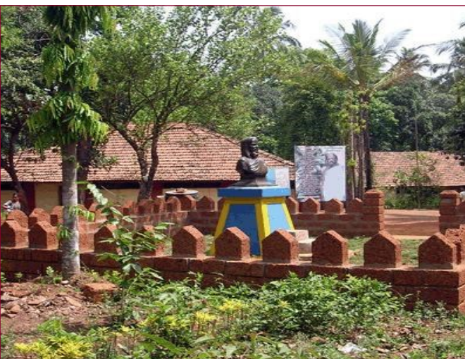
Fig. 6- Konkan Gandhi's Gopuri Ashram

This Ashram 2 km away from Kankavli. Konkan Gandhi's Gopuri Ashram is situated at Wagade. This Ashram established in 1948 situated on Mumbai-Kankavli-Goa highway on the bank of Gad River. This place is also prominent for the Ashram of Appasaheb Patwardhan, a spiritual leader who influenced on entire generation of Konkan [Fig-6].