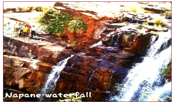
Fig. 2- Napane Waterfall

This waterfall is 13 kms away from Talere and 11 kms from Vaibhavwadi. This place is recognized as a novel tourist spot, birds resting zones. Napane (Sharpe) waterfall, a place of natural showers. There are providing tourist facilities like a water park, boating, water sports and Children Park etc. [Fig-2].