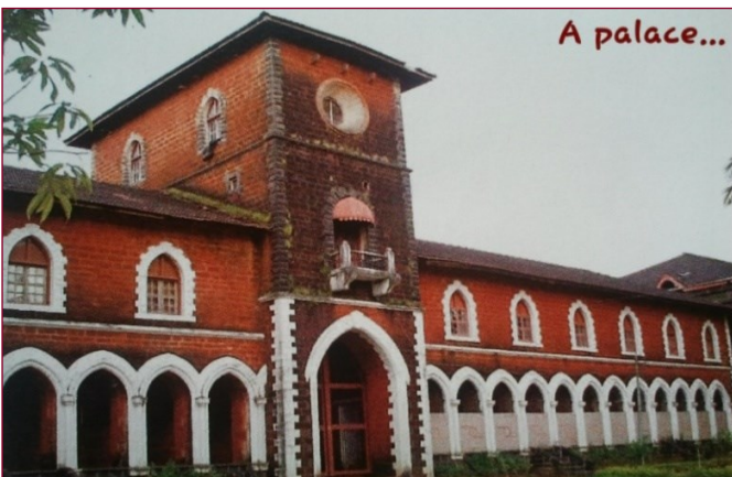
Fig. 10- The Palace of Maharaja Sawant Bhosale's of Sawantwadi

The Oldest ruling family in Konkan are the Sawant Bhosale's of Sawantwadi. The Kingdom was established in the 1627 by Khem-Sawant-I. In 1692 Khem Sawant-II established Sawantwadi [Fig-10].