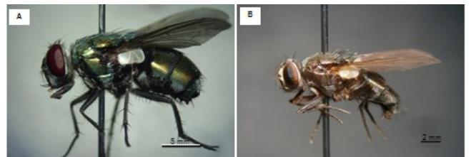
Fig. 2- Lateral views of medically important blow fly species in the Subfamily Lucillinae; (A) Hemipyrellia ligurriens and (B) Lucilia cuprina .