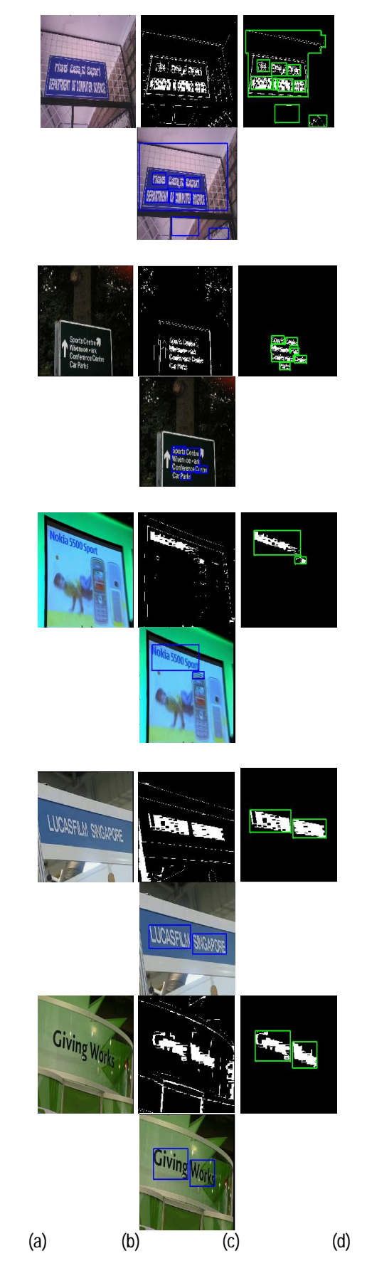
Fig/ 2-Sample results (a) Input images (b) Oriented Run length (c) Bounding boxes (d) Text detection

There are two other performance measures commonly used in the literature, Detection Rate and False Positive Rate; however, they can also be converted to Recall and Precision: Recall = Detection Rate and Precision = 1 -False Positive Rate [18]. Hence only the above four performance measures are used for evaluation. Table-1 and Figure-2 gives the objective subjective analysis of tested sample images for the performance of the two existing methods and the proposed method on the nonhorizontal text dataset. The proposed method has the highest recall, the second highest precision (almost the same as that of Laplacian method) and the highest Fmeasure. This shows the advantage of the proposed method because it achieves good results while making fewer assumptions about text and MDR, which is good as those of the Skeleton-Based method. The proposed method achieves a relatively high detection rate (88.43%) on the non-horizontal text dataset, which is much more challenging than graphics text due to its arbitrary orientation and low contrast. However, the proposed method also has a high FPR.