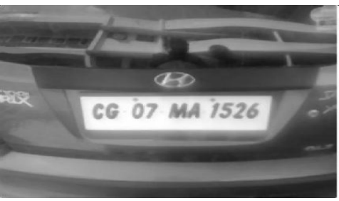
Fig. 3- Gray scale image