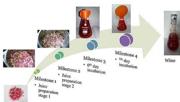
Fig-1 Stages of wine production from flowers (e.g., Nerium)

Wine is a product of the natural fermentation of the juices of fruits/flowers by the action of Saccharomyces cerevisiae . This biochemical conversion of juice to wine occur when the yeast cells become enzymatically degrade the fruits/flower sugars sucrose, maltose, glucose and fructose, first converted to aldehyde and then to alcohol. Carbon dioxide (CO 2 ) gas is released during this process. Extracting fermentable sugars from flowers are critical to the success of yeast fermentation, and production of alcohol could not occur without the work of amylase enzyme to breakdown starch into simple sugars that are usable by yeast. Present investigation was carried out for preparation of wine form different flower juices such as ixora, chrysanthemum, nerium, lotus and hibiscus. The production stages wine from flowers were schematically explained in [Fig-1].